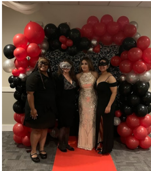
Staff at the Community Foundation Masquerade Ball