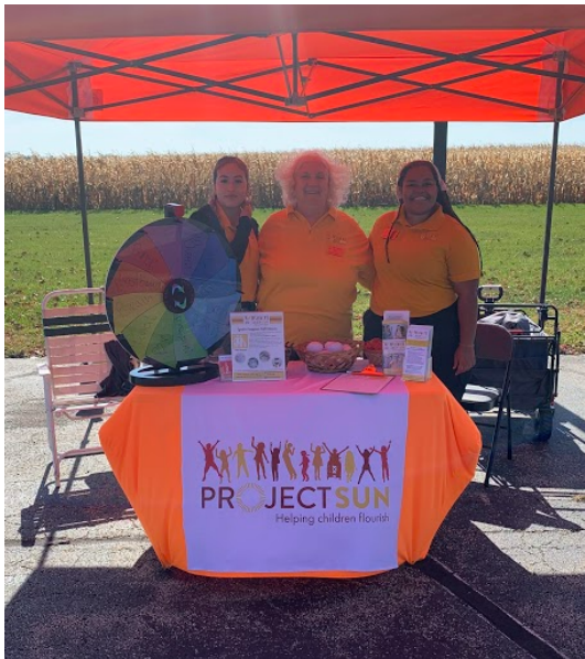
Project SUN table at the Strong House Fall Fest

she will be helping to staff our outreach events and provide support for our youth engagement activities.